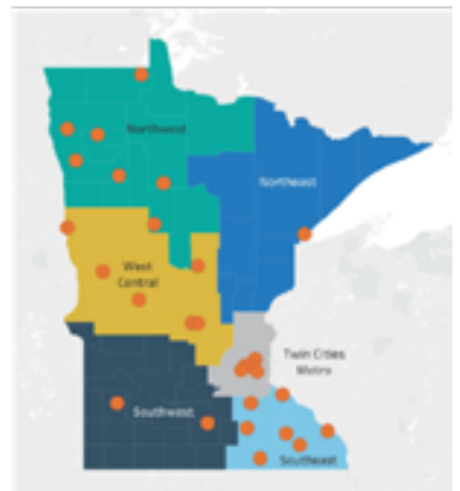
The Launch MN Network, uniting 6 regions, 7 hubs, and over 60 partners

Created with bipartisan support during the 2019 legislative session, Launch Minnesota – spearheaded by the Minnesota Department of Employment and Economic Development (DEED) – works with an advisory board, private sector stakeholders, support organizations, higher education, and innovative startups statewide.